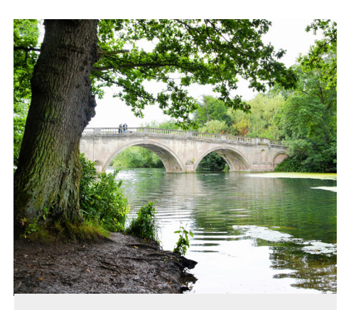
Clumber Park is well worth a visit

The Walled Kitchen Gardens are a pleasure; built in 1772 to supply the Dukes of Newcastle with vegetables and fruit, it is now home to the National Collection of apple varieties, including the new variety 'Pilgrim 400', and over 130 varieties of rhubarb! The 19th century glasshouses and palm house grow plants and produce all year around, offering glorious displays. Home grown produce is also used in the Garden Tea Room, where a variety of food and drinks are served. The beautiful lakeside provides stunning views and breath-taking walks. (Entry fees apply).