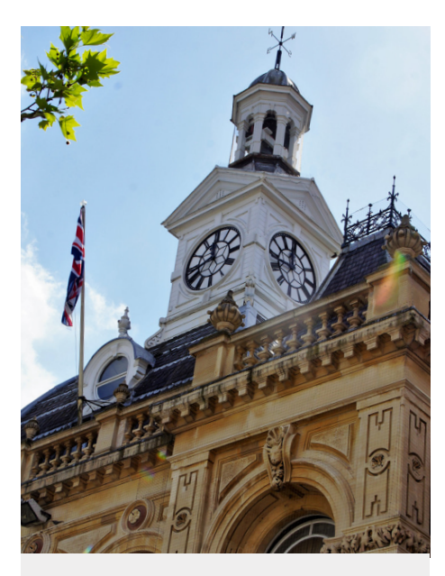
Reford Town Hall in the Market Square