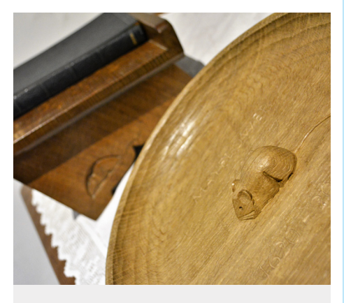
Find All Saints' famous mouse carvings

Listen to the story of how one young boy discovered the crypt where the Chalice and Bible were found, and view replicas of those historical findings. Search for the hidden Mayflower Mice, hear family stories of life in the hamlet of Babworth, explore the beautiful woodland setting and walk along the Pilgrim Way.