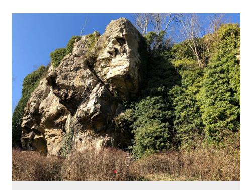
The breathtaking Creswell Crags

There are regular cave visits and the on site museum hosts many displays and exhibitions throughout the year, taking you on a natural history journey through time. A superb café with far reaching views, serving a variety of tasty treats and refreshments is also available.