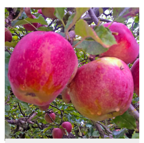
A great tribute to mark the occasion

A number of these exquisite trees are to be planted in various locations along key destinations of the Mayflower Pilgrim Trail and can be viewed on this tour.