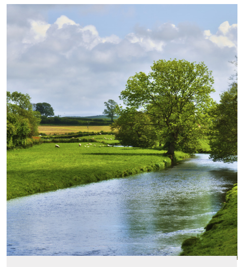
See the best of our wonderful county

Take a guided Mayflower Pilgrim Walk with successful Author and Photojournalist, Sally Outram. Follow in the footsteps of the Mayflower Pilgrims with a selection of circular walks which follow the Pilgrims Trail. The routes explore historic sites which are associated with the Pilgrims. Visit tranquil, quintessentially English villages, rivers and canals, see an abundance of wildlife, flora and fauna. (Additional cost applies). For more information and to book, please contact Sally Outram on 07986 011 903 or visit mayflowerpilgrimsnottinghamshire.com