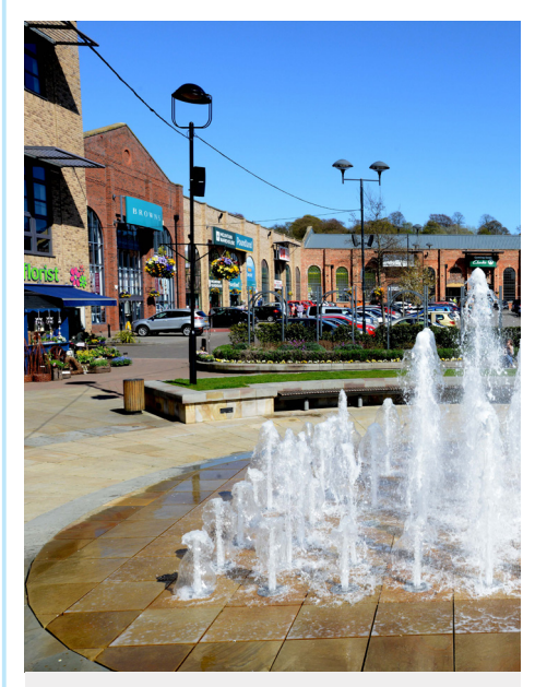
Marshall's Yard, Gainsborough

Shopping centre in Gainsborough has a choice of cafés and restaurants. Coach parking available. www.marshallsyard.co.uk t: 01427 810 706