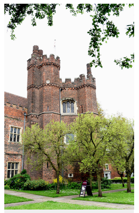
Gainsborough Old Hall