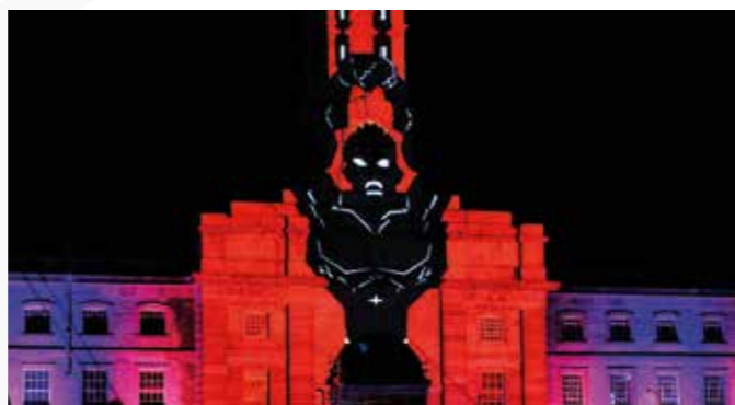
Plymouth Illuminate 2018