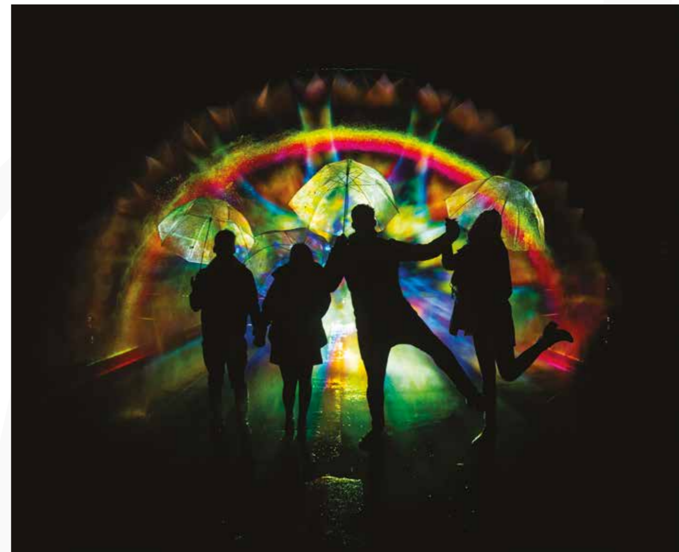
Plymouth Illuminate 2018.