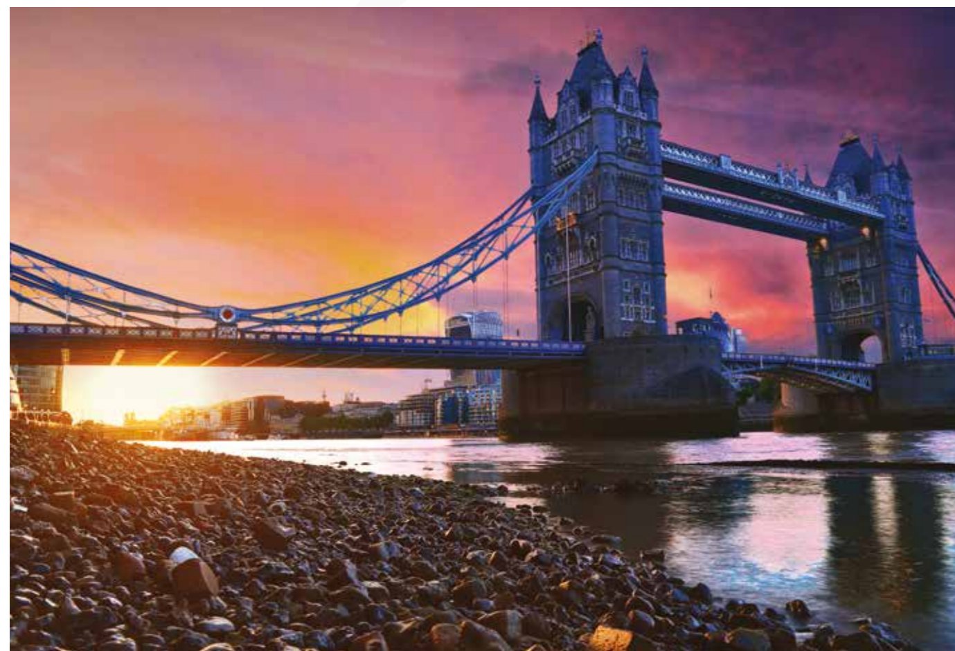
18 Tower Bridge, London