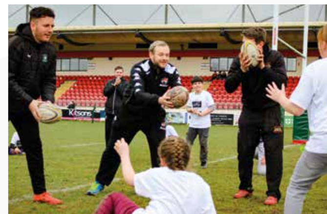
Argyle Community Trust Sports Week