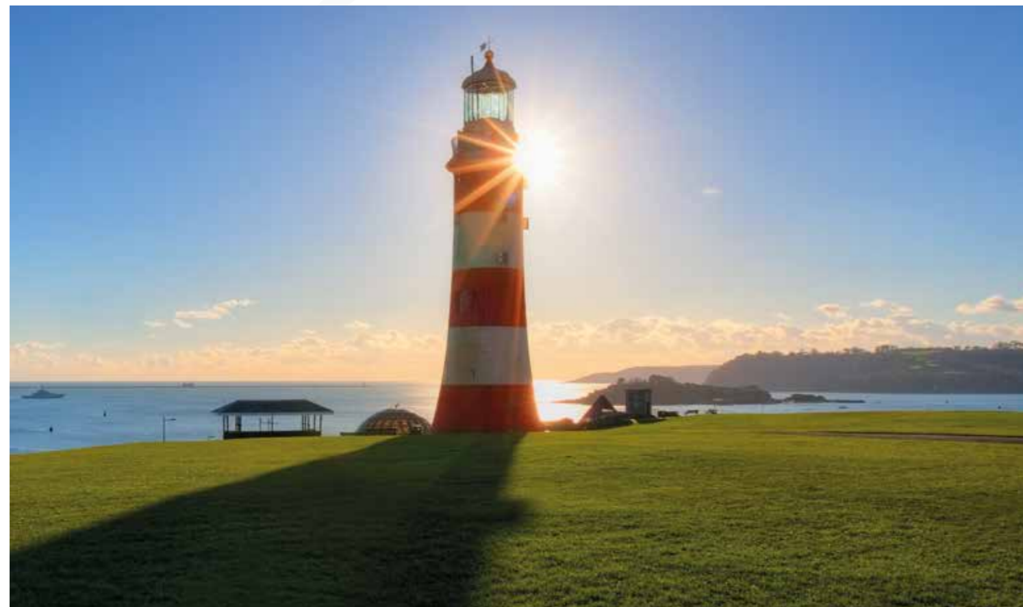
16 Smeaton's Tower, Plymouth