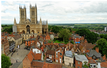
The historic city of Lincoln

Explore the cobbled streets of the historic city of Lincoln, see Lincoln Castle, home to the 1215 Magna Carta, and visit the magnificent Lincoln Cathedral, once the tallest building in the world.