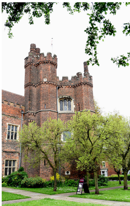
Gainsborough Old Hall