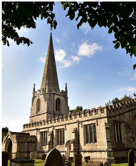
St Wilfrid's Church, Scrooby

Brewster had long been attracted by and was fined for non-attendance at St. Wilfrid's Church where he was likely baptised and married. Visitors are able to sit in the original wooden pews.