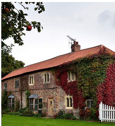
Scrooby Manor House