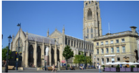
Boston's historic market place