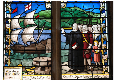
Boston stained glass window

From Lincolnshire head south into Cambridgeshire and visit the historic city of Cambridge. Many of the Separatists attended Cambridge University including William Brewster, John Robinson and John Smyth.