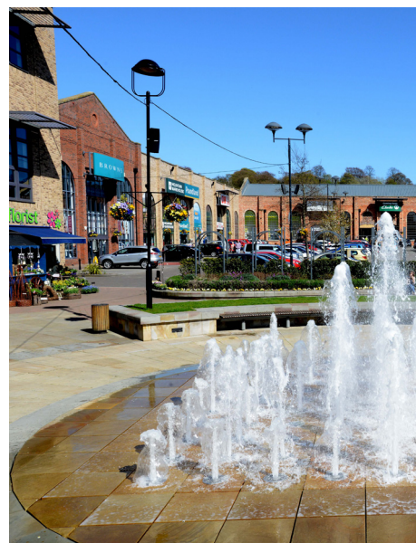
Marshall's Yard, Gainsborough

Shopping centre in Gainsborough has a choice of cafés and restaurants. Coach parking available. www.marshallsyard.co.uk t: 01427 810 706