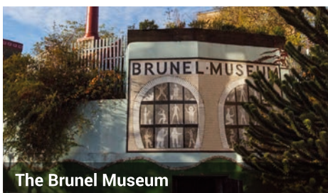
The Brunel Museum

Just fifty yards from Rotherhithe Station is a narrow door through which you can descend into the 1825 shaft via a makeshift staircase. You find yourself inside a huge round cavern, smoke-blackened as if the former lair of a fiery dragon.