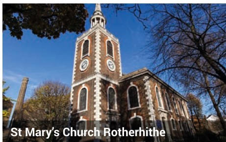
St Mary's Church Rotherhithe