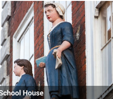
Old School House