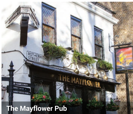
The Mayflower Pub

The Mayflower pub stands on the site of The Shippe pub that dates back to around 1550. It is close to where the Mayflower ship was fitted out for the long transatlantic voyage. The pub has many references to the Mayflower Pilgrims and captain Christopher Jones, including the passenger list. Mayflower Descendants can sign the descendants visitors book. The pub is also the only pub in England that sells stamps!